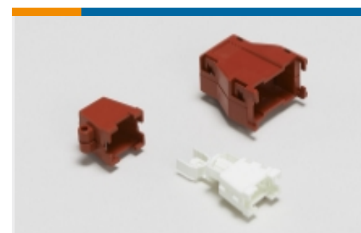
Rectangular Boots & Strain Relief(1)