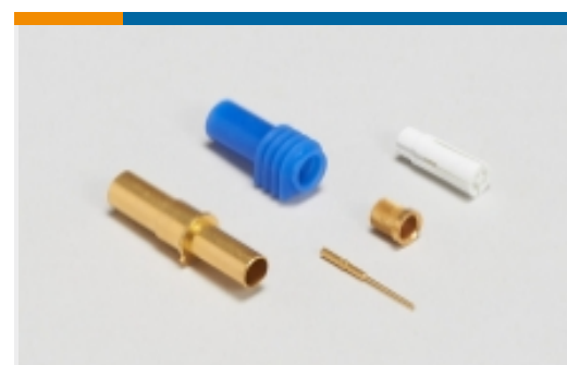
Rack & Panel Contacts(20)